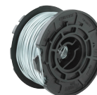
TW1061-EG Electro Galvanize