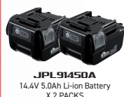
JPL91450A 14.4V 5.0Ah Li-ion Battery X 2 PACKS