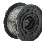
TW1061T Regular Steel